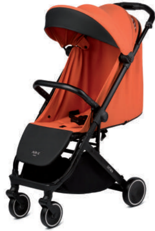
#AX (01) terracotta