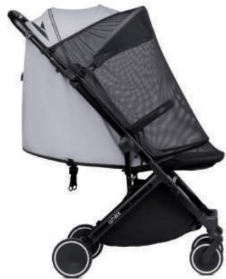
#Ax/Ac (m01) mosquito net