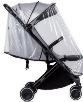
#Ax/Ac (r01) rain cover