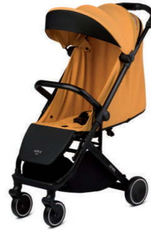
#AX (04) yellow