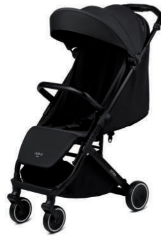
#AX (02) black