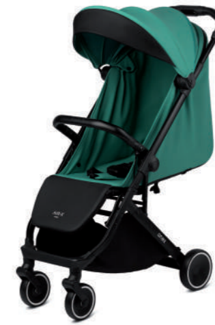
#AX (05) green