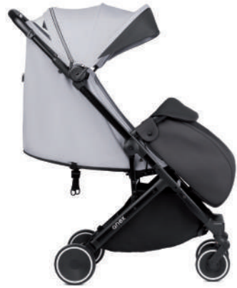
#Ax/Ac (f01) footcover