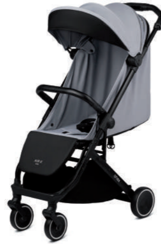
#AX (03) gray